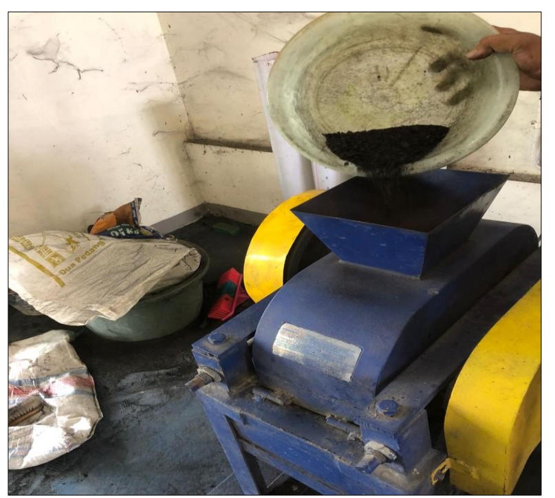
Figure 2. Coal sample preparation