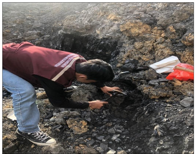
Figure 1. Coal sampling

The results of both proximate and ultimate analysis are then carried out data processing, the data is collected in a table and then an approach is made by making a graph that shows the value of the results of the proximate and ultimate analysis so that a conclusion can be drawn.